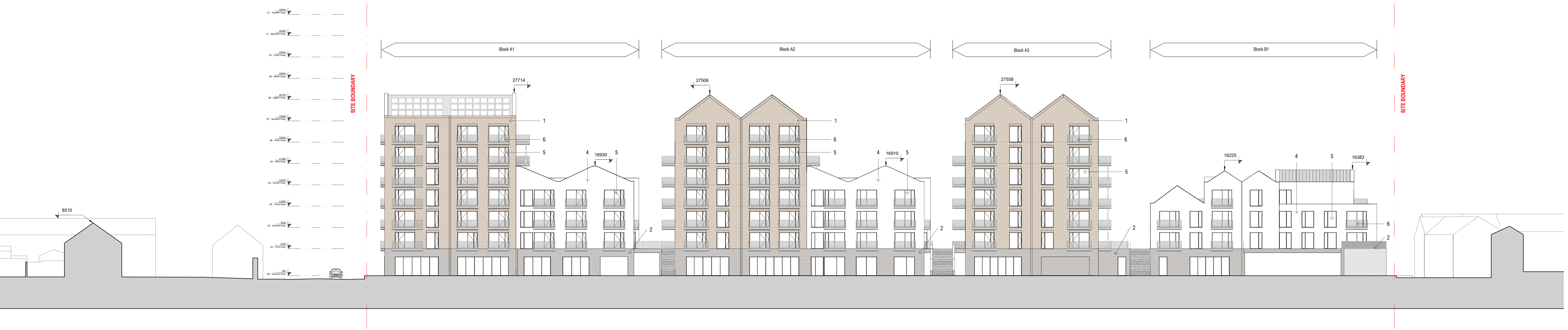
Continuation Site Section 5 1:200