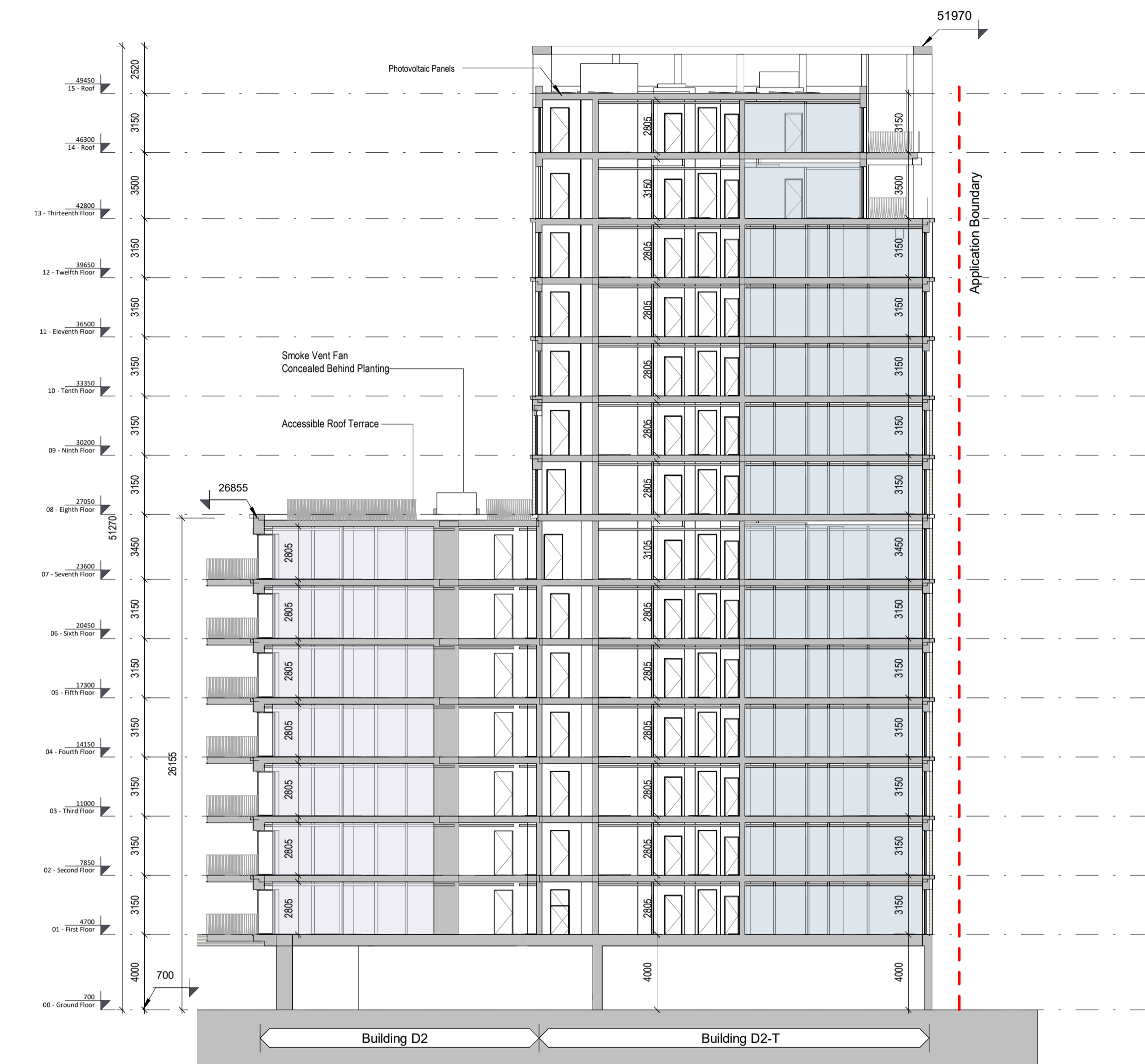
1 D2 & D2-T Section B-B 1:200