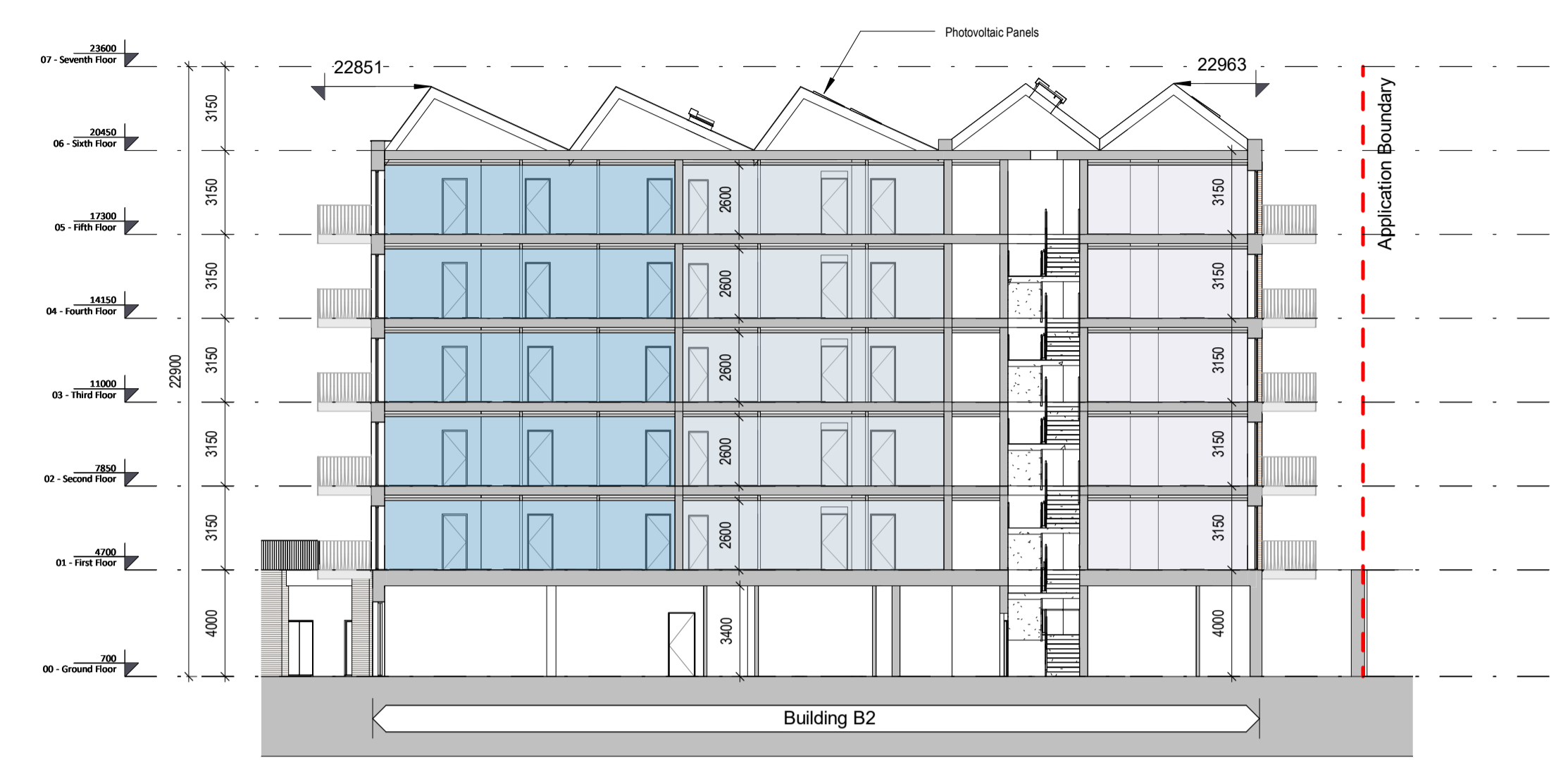
2 B2 Section B-B 1:200